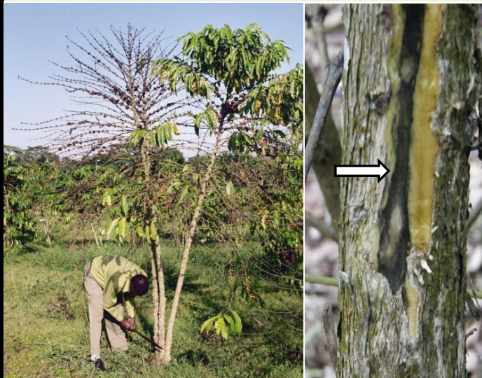
Coffee wilt disease (FUNGUS - Gibberella xylarioides )