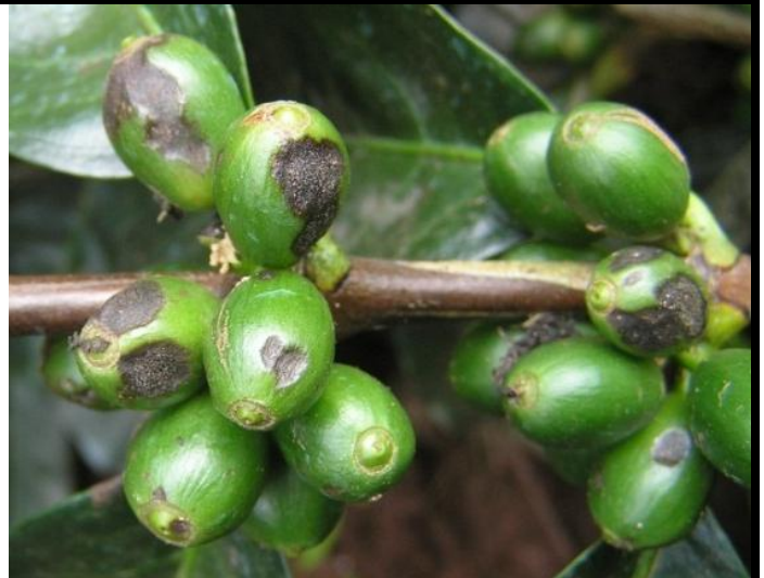
Coffee berry disease (FUNGUS - Colletotrichum kahawae )