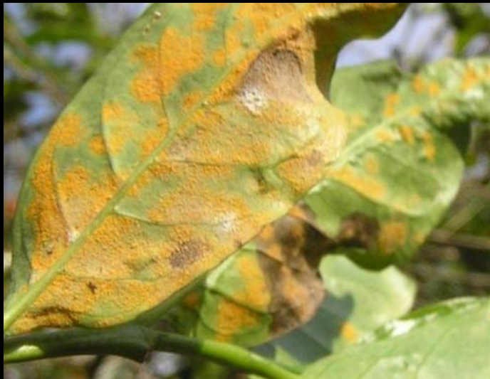
Coffee leaf rust (FUNGUS - Hemileia vastatrix )