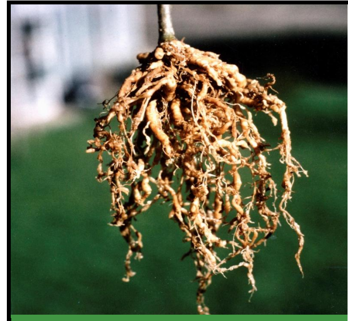
Root knot nematodes NEMATODE - ( Meloidogyne incognita )