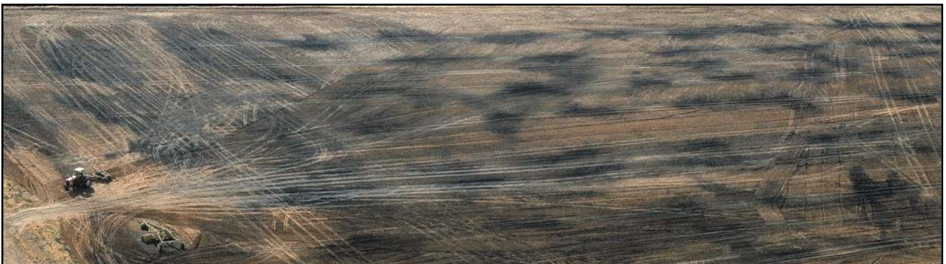
Plate 16. An aerial photograph showing very uneven spreading of ash in a field. Uneven spreading decreases the benefit of ash to crops.