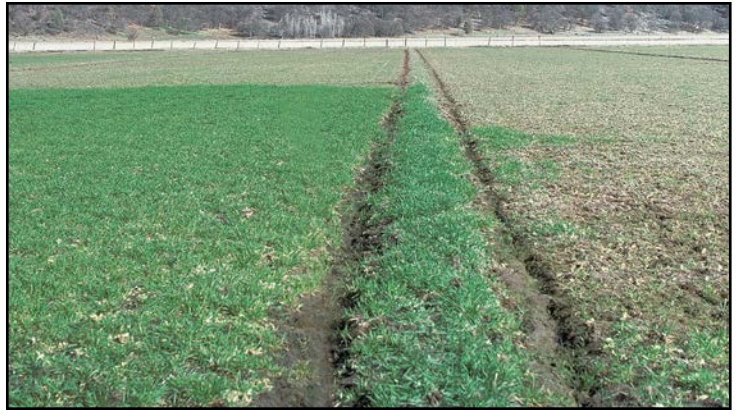
Plate 19. A large legume-wheat plant growth response of greater than 2.5 tons per acre (5.6 Mg/ha) from ash application of 100 dry tons per acre (225 Mg/ha), left, compared to no ash, right. The soil was slightly acidic (pH 5.7) and low in phosphorus and potassium.