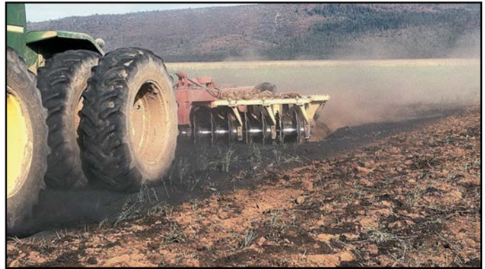
Plate 14. Ash is incorporated effectively using a large tandem or double disk with disks 18 to 24 inches (45.5 to 61 cm) in diameter.