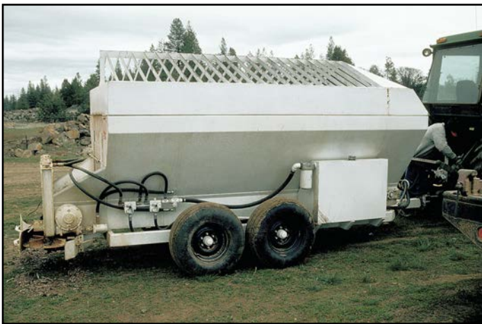
Plate 5. A spreader equipped with a grate or screen on the top can be used to remove large particles from the ash.