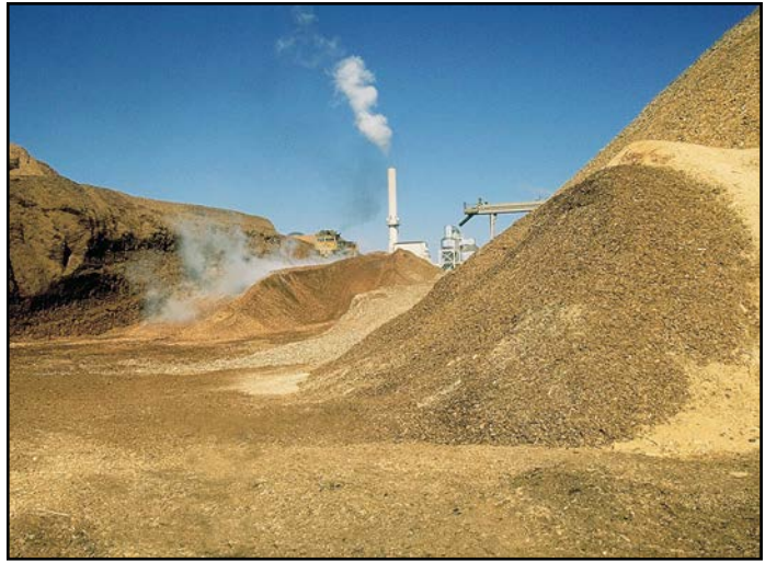
Plate 2. Large piles of wood chips are mixed together before being burned in the power plant in the background.