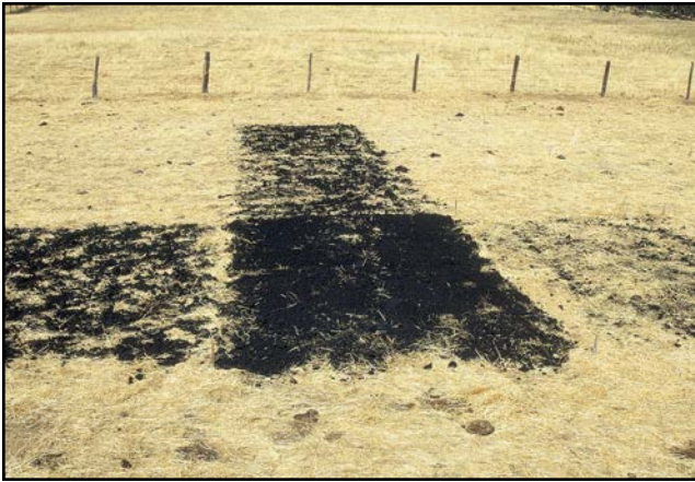
Plate 7. Ash application rates (100 percent dry matter basis) on rangeland: 20 tons per acre (45 Mg/ha), right; 40 tons per acre (90 Mg/ha), left and in back; and 80 tons per acre (180 Mg/ha), center foreground.