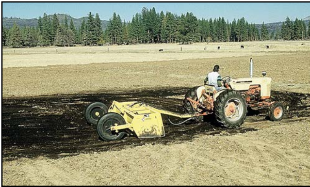
Plate 13. A grader, scraper (shown here), blade, or landplane traveling perpendicular to the windrows can be used to spread the ash uniformly in the field.