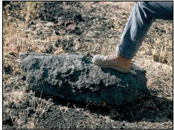
Plate 4. Large blocks of ash, rocks, and other debris should be removed from ash before spreading in the field.