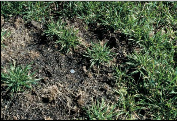
Plate 18. The quarter gives a perspective as to how greatly plant density has been reduced by heavy ash application compared to the upper right corner of photo, where a higher plant density exists.