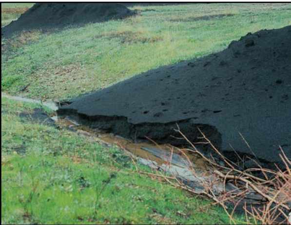
Plate 20. Avoid storing or applying ash near streams or intermittent watercourses.