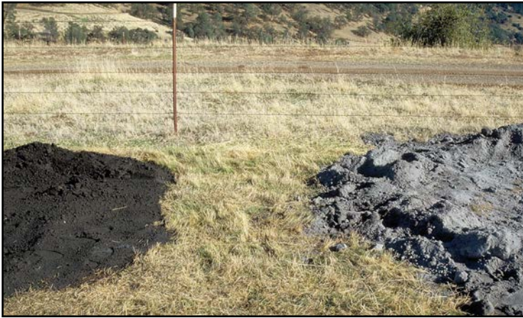
Plate 3. Two most common types of ash: high-carbon black ash, left, and low-carbon gray ash, right.