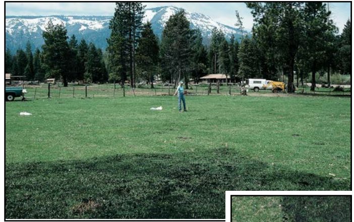
Plate 8. Ash applied on irrigated pasture at 16 dry tons per acre (36 Mg/ha). The inset shows a close up of no ash, left, and ash applied at 16 dry tons per acre, right.