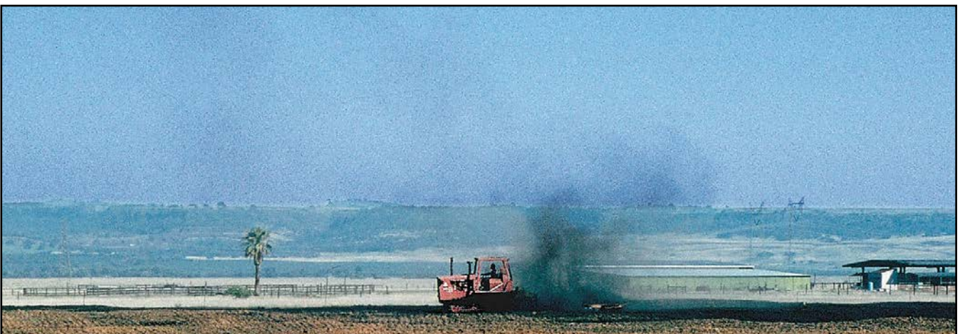
Plate 22. Avoid excessive movement by wind during spreading and incorporation of ash.