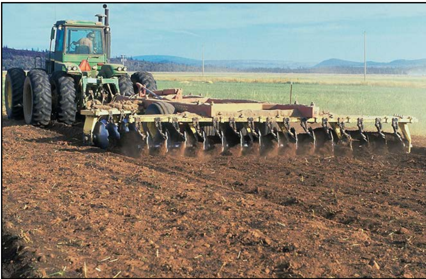
Plate 15. A second pass over the field with the tandem disk at a 45° to 90° angle to the first disking assures more complete incorporation of the ash.