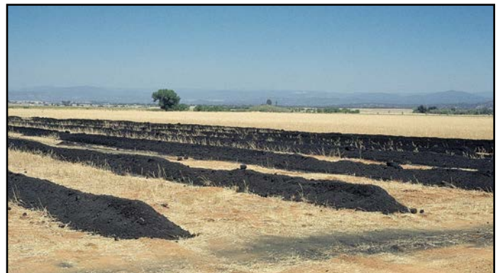
Plate 12. Small, uniform windrows that are more closely spaced allow for uniform spreading in the field.