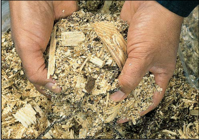
Plate 1. Chipped wood, a fuel used by many power plants.