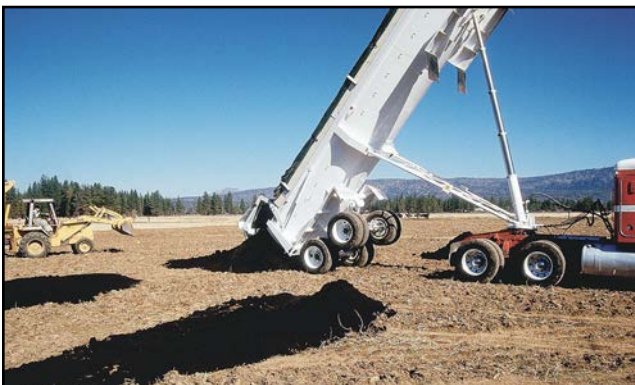
Plate 11. A large dump truck unloading ash in piles in a field.