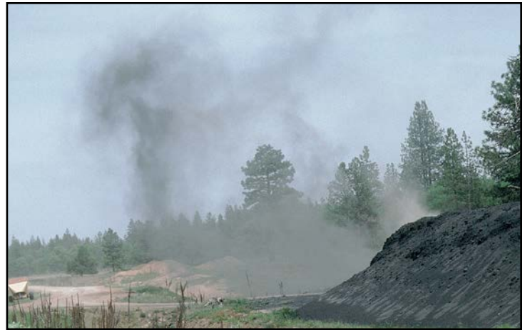
Plate 21. Ash should be stored in areas surrounded by trees where it can be protected from movement by wind. Some movement is unavoidable during loading and spreading of ash.