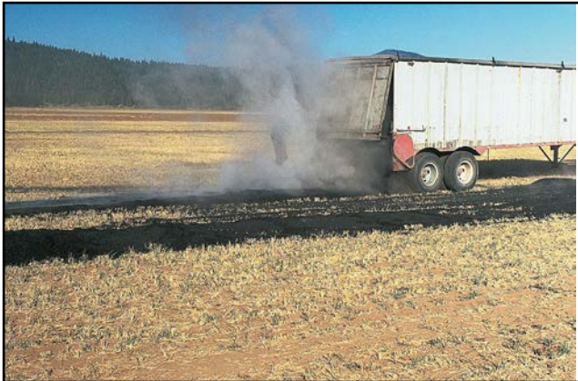
Plate 9. A truck with a moving floor unloads ash in strips in a field.