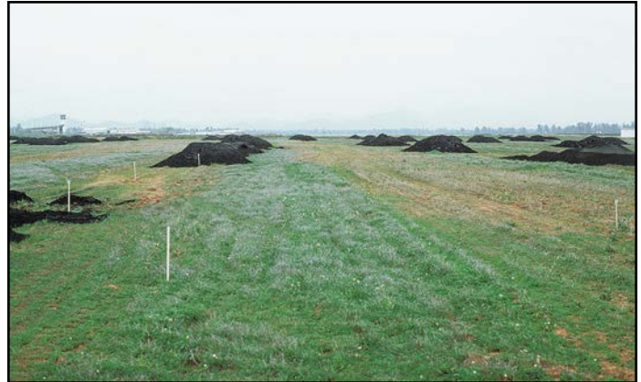
Plate 10. Driving stakes in the field at planned spacing and intervals provides for more accurate rates of application.