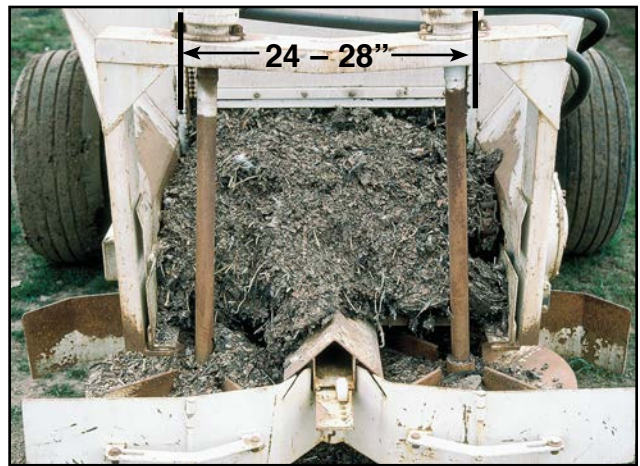
Plate 6. A wide opening in the spreader—24 to 28 inches (61 to 71 cm) wide, as shown here—allows ash to feed properly onto the spinners for uniform distribution in the field.