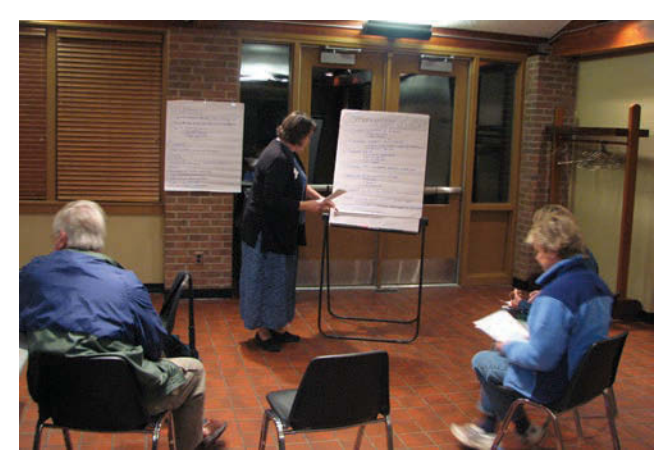
Partners gather for a meeting of the West Michigan Cluster of The Stewardship Network.

The steering committee organizes members, establishes priorities, develops strategic management and annual operating plans, documents progress, and reports on goals accomplished by participants. This group provides direction, identifies opportunities, and generally furthers the common goals of the CWMA.