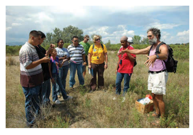
The ability to bring people together and good communication skills are important in a champion.

A key element to the success of a CWMA is finding someone who is excited about cooperative weed management to lead the group as it forms. This leader or champion should have enthusiasm, commitment to creating a successful organization, and the time and ability to motivate others to participate. The main tasks of the champion are to invite potential partners, organize and run meetings, make calls, move the group toward organization, and follow up on action items (e.g. make sure agreements are reviewed and signed by all partner groups).