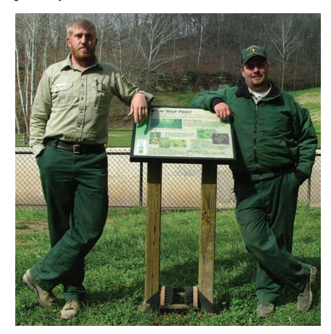
A boot brush station at the entrance to a natural area will help keep invasive species out when used properly and consistently.

Prevention is by far the most cost-effective strategy when it comes to invasive species. Working to stop the introduction and spread of invasive plants in your CWMA should be a priority.