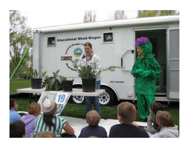
Educational Weed Wagon presentation, Crooked River WMA, Oregon.

Raising awareness about invasive plants within a community is one of the most important functions of a CWMA. Here are a few examples of projects that CWMAs have used to educate a wide variety of audiences.