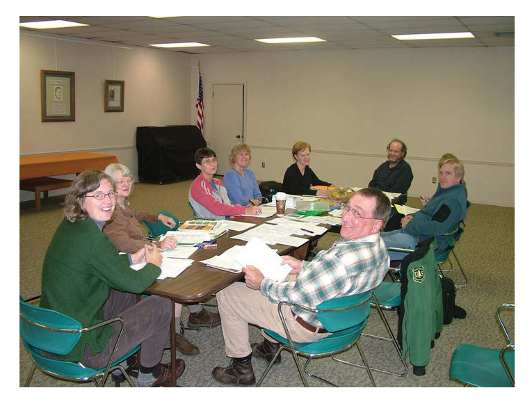
Ohio's Iron Furnace CWMA Steering Committee hard at work.

For examples of an MOU and a Hold Harmless Agreement, see www.mipn.org.