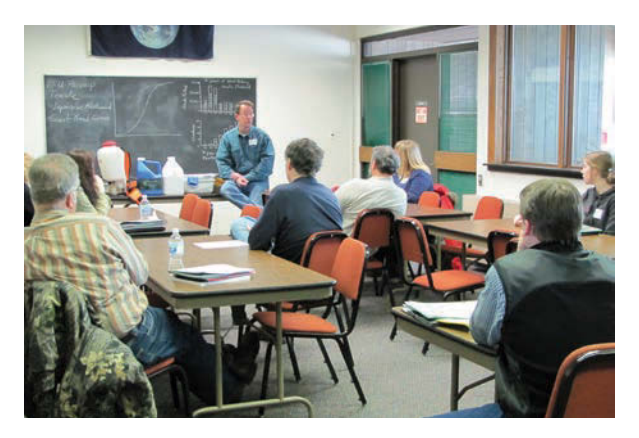
Meeting of the Southeast Wisconsin Invasive Species Consortium.