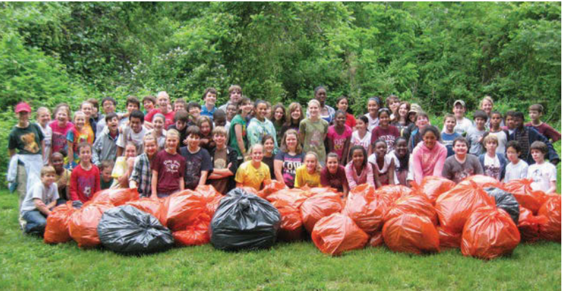
A garlic mustard pull event for K-12 students organized by the River to River CWMA.

Collaborated with CWMAs in Ohio and Indiana to survey the Ohio River and its tributaries for invasive plants