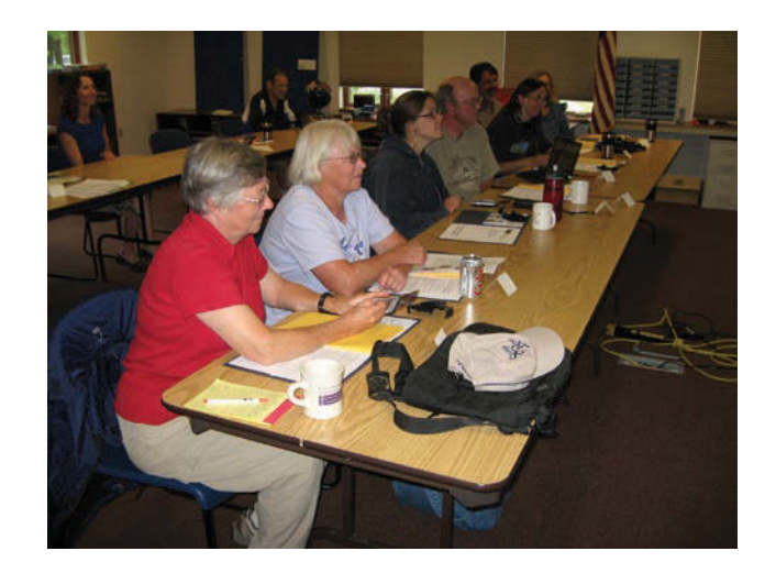
Training volunteers on mapping and data sharing in Wisconsin.

The steering committee may also appoint a vice-chairperson to assist with leadership and administrative tasks or other officers as necessary.