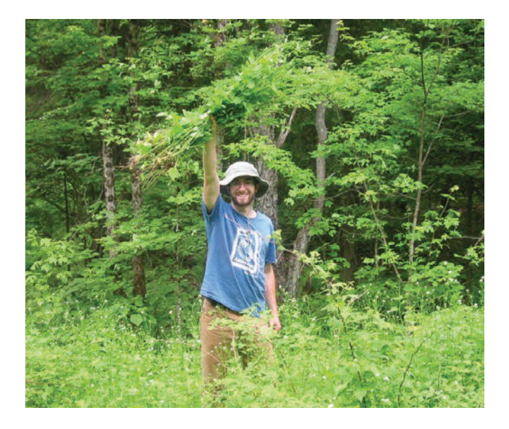
Volunteer pulling garlic mustard for the Adirondack Invasive Plant Project, New York.