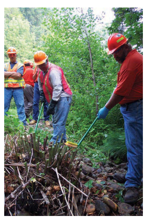
Using cut-and-swab treatment to control Japanese knotweed, Adirondack Park Invasive Plant Program, New York.

CWMAs include local citizens, city, county, state, tribal and federal leaders, and both nonprofit organizations and for-profit corporations to more effectively control invasive plants across property lines. Some CWMAs have been started by government agencies taking a larger, region-wide approach to invasive plant management, while others have been formed by concerned citizens partnering with agencies, organizations, and corporations that can provide additional resources. No matter where the impetus comes from to start a CWMA, the goal is the same: to work together with all