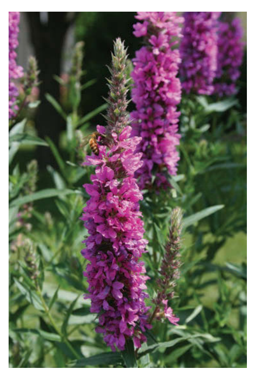
Purple loosestrife ( Lythrum salicaria )

Despite their different interests, partners may be able to agree on a common concern, such as a particular invasive species (e.g. garlic mustard) or group of species (e.g. woody invaders of forests), protection of a treasured natural area, or a pressing issue like early detection of new invaders. Alternatively, the group may agree on a desired outcome (e.g. improved bird habitat, clear hiking trails, native plant restoration) and then work backwards to determine what actions are necessary to achieve that vision. Talk to neighbors and community leaders about invasive plants to find out which issues you all agree on. Focus on at least one common concern or shared vision to initiate a CWMA.