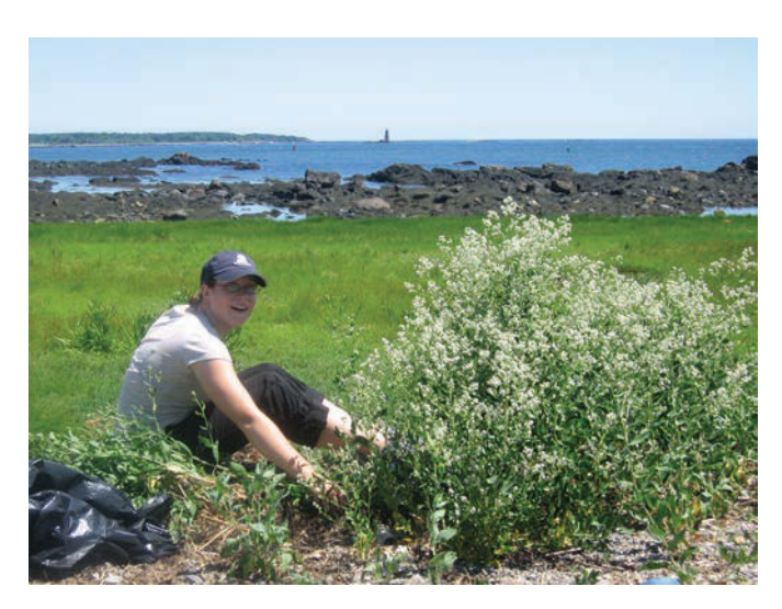
Early detection of perennial pepperweed ( Lepidium latifolium ) by the Coastal Watershed Invasive Plant Partnership of New Hampshire.

It is important to monitor the effectiveness of projects. For instance, did the Volunteer Invasive Plant Control Day significantly decrease the garlic mustard in the area? In addition to weed population and control efforts, the desired natural community should be monitored as well. Fo-