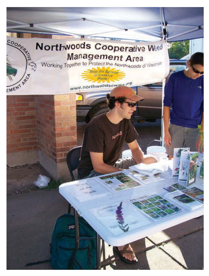
The Northwoods CWMA in northern Wisconsin rented a table at the local farmer's market to educate the community about invasive plants.

CWMAs are highly visible, building community awareness and participation. Cooperative