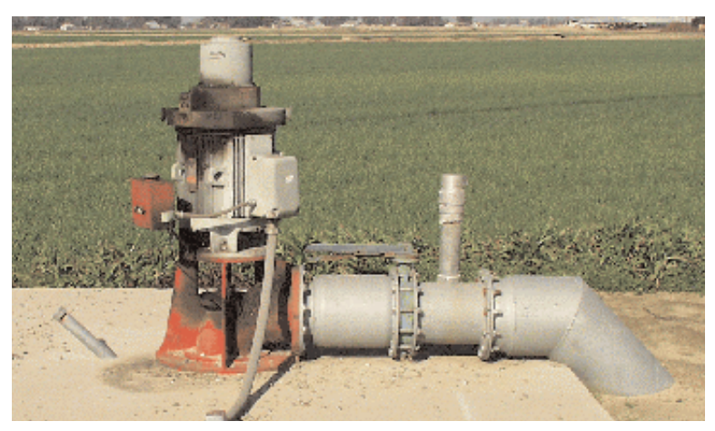
Figure 3. Properly completed well with elevated concrete seal (but with leaking lubricant).

Once the well development and aquifer test pumping equipment is removed, it may be useful to use a specialized video camera to check the inside of the well for damage, to verify construction details, and to make sure that all the screen perforations are open.