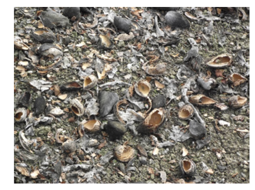
Figure 2. Example of almonds predated by rodents.

almond orchards, so long as ground cover is limited. If burrow openings are larger (2–3 inches), the roof rat is the likely culprit.