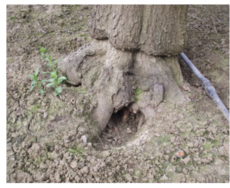
Figure 1. Example of a rat burrow at the bottom of an almond tree.

pest management program. If your management plan focuses on the wrong species, it is likely to be ineffective and it may pose hazards to nontarget species and even be an illegal misuse of the material, based on the rodenticide label information. Fortunately, the presence of roof rats and deer mice can often be detected through indirect monitoring techniques. For example, roof rats often burrow at the bottom of trees, and these burrows are typically 2 to 3 inches in diameter (figure 1). Burrows of the California ground squirrel (Otospermophilus beecheyi) are sometimes this same size, but usually they are a bit larger (average diameter = 4 inches). Also, if ground squirrels are present, you will see them running around above ground and hanging out in burrows.