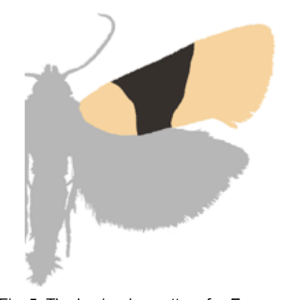
Fig. 5: The basic wing pattern for E. ambiguella consists of yellowish forewings with a dark brown to black band extending across the wing. The band is wider along the costa and narrower along the dorsum; this is opposite to that of many North American nontarget Cochylini.

Traps that are to be shipped should be carefully packed following the steps outlined in Fig. 7. Traps should be folded, with glue on the inside, making sure the two halves are not touching, secured loosely with a rubber band or a few small pieces of tape. Plastic bags can be used unless the traps have been in the field a long time or contain large numbers of possibly rotten insects. Insert 2-3 styrofoam packing peanuts on trap surfaces without moths to cushion and prevent the two sticky surfaces from sticking during shipment to taxonomists. DO NOT simply fold traps flat or cover traps with transparent plastic wrap (or other material), as this will guarantee specimens will be seriously damaged or pulled apart – making identification difficult or impossible.