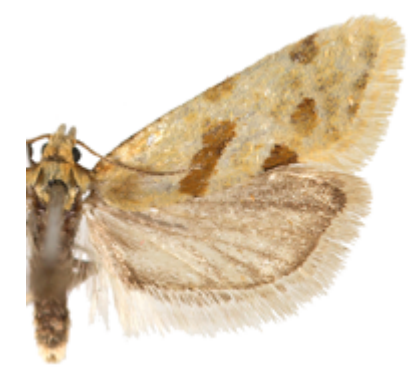
Fig. 13: Aethes smeathmanniana.