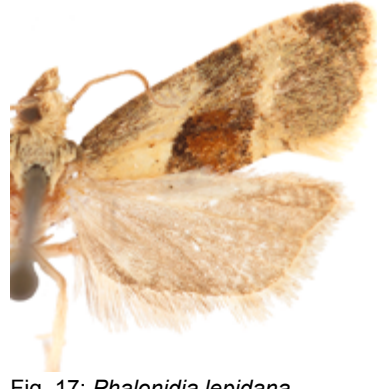
Fig. 17: Phalonidia lepidana.