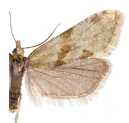
Fig. 11: Aethes deutschiana.