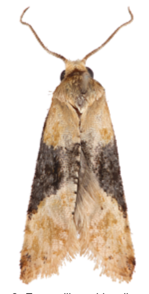
Fig. 2: Eupoecilia ambiguella male.

CAPS Approved Trapping Method: Wing pheromone trap