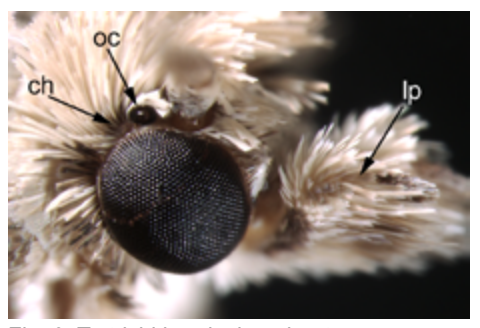
Fig. 6: Tortricid head; ch = chaetosema; oc = ocellus; lp = labial palpi. Note that the chaetosema is above the compound eye behind the ocellus.