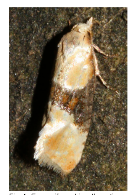
Fig. 1: Eupoecilia ambiguella resting adult (Photo from Photozou).

Gilligan, T. M. & M. E. Epstein. 2012. TortAI, Tortricids of Agricultural Importance to the United States (Lepidoptera: Tortricidae). Identification Technology Program (ITP), USDA-APHIS-PPQ-S&T, Fort Collins, CO. (http://idtools.org/id/leps/tortai).