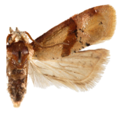
Fig. 15: Cochylis caulocatax.