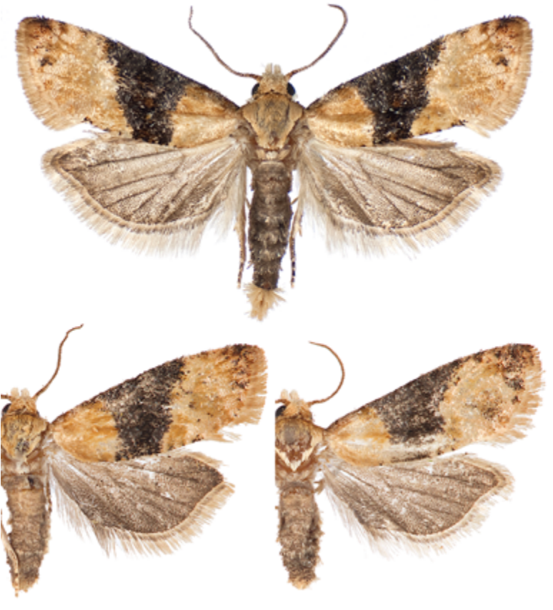
Fig. 4: Variation in wing pattern and coloration of E. ambiguella adults. The wing pattern is the same in both males and females and consists of yellowish forewings with a dark brown to black band extending across the wing (also see Fig. 5).