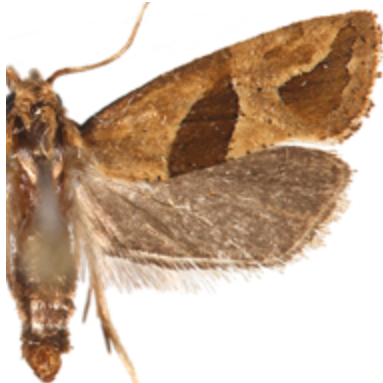
Fig. 18: Carolella sartana.