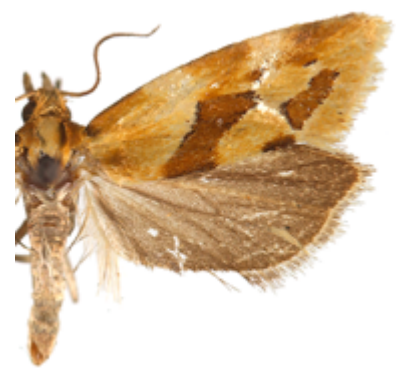
Fig. 14: Aethes Iouisiana.