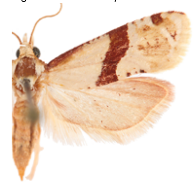
Fig. 19: [Nycthia] pimana.

It is expected that other Cochylini will be attracted to E. ambiguella pheromone traps; a sampling of non-target Cochylini with similar forewing patterns is shown on this page. Note that these species have not been verified to be attracted to E. ambiguella pheromone traps and that nontargets will vary by region. Trapping results from the northeastern United States in the 1990's found Noctuidae, Tortricidae, and miscellaneous Gelechioidea were captured. Two very common tortricids were Episimus argutanus (Fig. 20) and Paralobesia viteana (Fig. 21). In California, it is possible that E. ambiguella traps will also attract male Lobesia botrana (EGVM; Fig. 22).