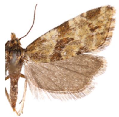
Fig. 12: Aethes deutschiana.