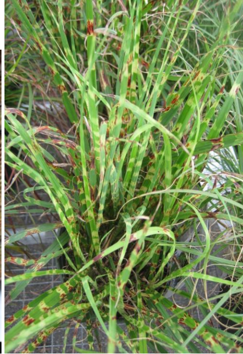
Figure 4: Miscanthus Blight

Miscanthus can be affected by a number of different leaf spotting fungi. One of the more noticeable is Miscanthus Blight, caused by the fungus Stagonospora . You will see purplish or rust colored spots and streaks on the leaves, especially the white sections of the variegated leaves. From a distance, with its rusty appearance, it is often mistaken for a rust disease.