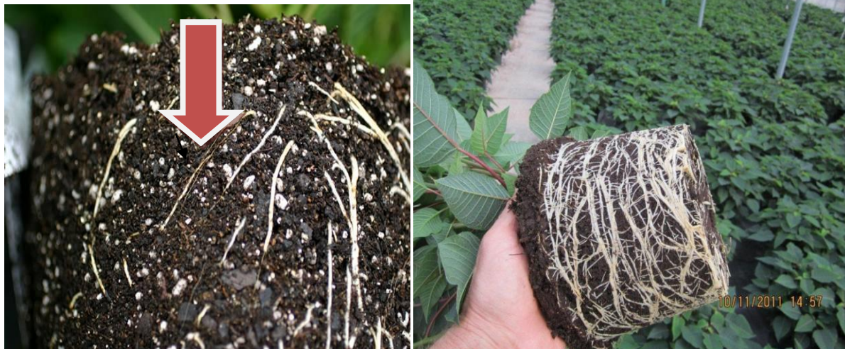
Figure 1: Fungus gnat feeding damage, Photo by L. Pundt Figure 2: Healthy root system, Photo by R. McGaughey

Encourage Good Root Development on Poinsettias Now – It's important not to stress young roots by high salt or ec levels, compacted media (due to overwatering) or by not controlling low levels of fungus gnat larvae early . Waiting until you see extensive damage (see below), makes it almost impossible for the root system to recover before short days begin. Keeping plants actively growing in August and September by developing a good root system is crucial to having high quality poinsettias.