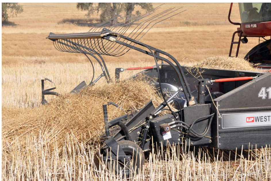
Figure 1: Windrowing prior to harvest is the more common practice.

Canola crops can be either windrowed (Figure 1) or direct-harvested. The method chosen depends on the availability and cost of contract windrowing, the type of harvesters available and the relative risk of adverse weather in a particular locality. Some of the advantages of windrowing are: uniform ripening, earlier harvesting (7–10 days), less exposure to spring storms and rain, reduced shattering losses during harvest, and less hail and wind loss. Harvesting can usually continue ‘around the clock’. 1 Some advantages of direct heading include cost, availability of headers on the farm, and a higher harvest index on low-yielding crops. There is also a problem with windrows in lower yielding crops being susceptible to being blown around by wind, causing extensive losses.