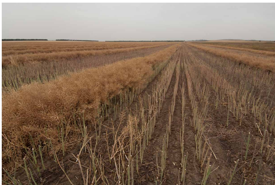
Figure 5: Windrowed crop prior to harvest. The cut material is laid on top of the lower stem material to allow air movement.