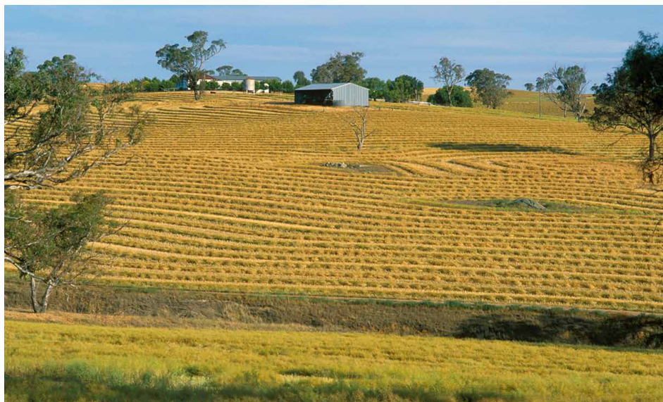
Figure 2: Windrowed canola near Binalong, NSW.

Canola is an indeterminate plant, which means it flowers until limited by temperature, water stress or nutrient availability. As a result, pod development can last over 3–5 weeks, with lower pods maturing before higher ones. Consequently, canola is often windrowed to ensure that all pods are mature at harvest (Figure 2).