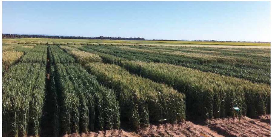
Photo 3: These cereal plots show the differences in maturity of varieties grown in trials at Inverleigh, Victoria, in 2013. The plots were all sown on 10 May but maturity ranged from ear emergence (GS51) to milk development (GS71) in October.

Varietal maturity is important to take into consideration when deciding when to sow (Photo 3).