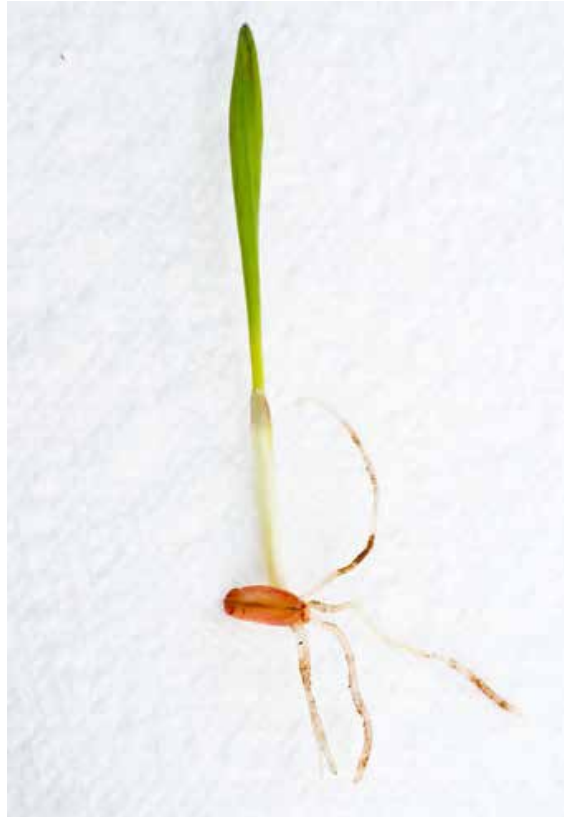
Photo 5: The coleoptile is the pointed, protective sheath that encases the emerging shoot as it grows from the seed to the soil surface.