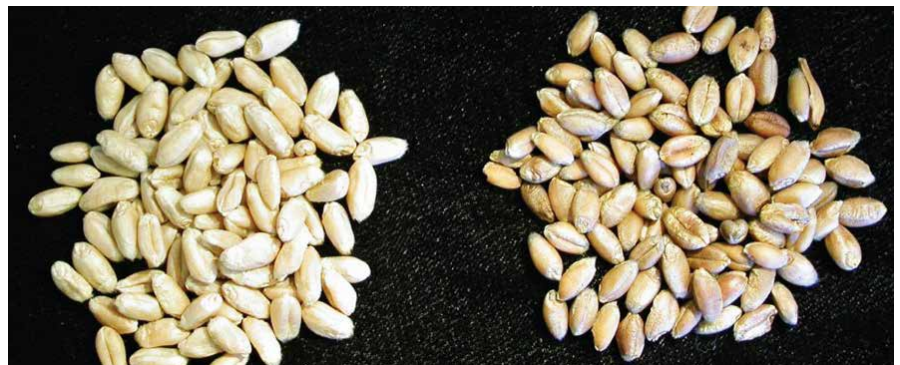
Photo 4: Normal seed (left) compared to heat-damaged seed (right). Note the distinct colour difference.