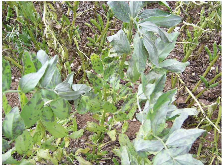
Photo 3: A faba bean crop that has been crop-topped, and shows leaves that are drying down.