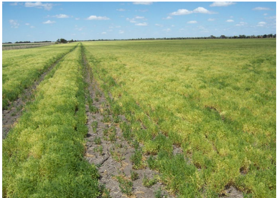
Photo 9: Green plants on wheel-track edges and also greener parts of a paddock. If desiccated too early issues with grain quality can occur.