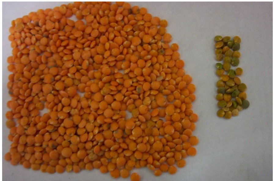
Photo 3: Green kernel (right) due to early desiccation of red lentil. A maximum of 1% is allowable in receival and export standards.

Seed should then be shelled from the pod and the representative seed sample assessed as to the proportion of dark green seed (maximum 50%) and yellow-buff colour seed (minimum 50%). If clear green seed (Photo 3) is present in the sample, then the crop is too immature and should be reassessed at a later date.