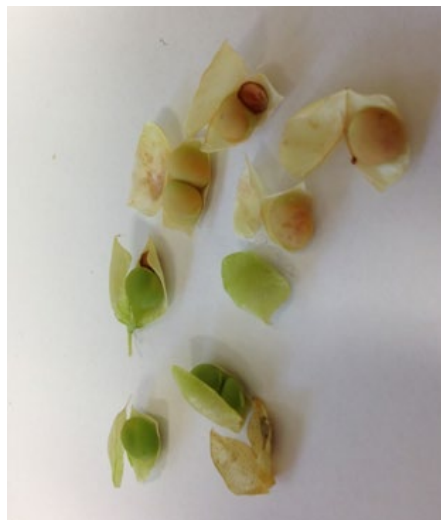
Photo 15: Varying stages of maturity of seeds in pods of PBA Blitz th at the stage of crop-topping.