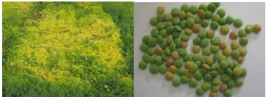
Photo 12: Lentil crop with ryegrass at its optimum stage for crop-topping (2010).

Photo: Grain yield implications of crop-topping pulses for late weed control in south-eastern Australia. "Capturing Opportunities and Overcoming Obstacles in Australian Agronomy", (2012), Proceedings of 16th Australian Agronomy Conference 2012, http://www.regional.org.au/au/asa/2012/weeds/8099_linesml.htm