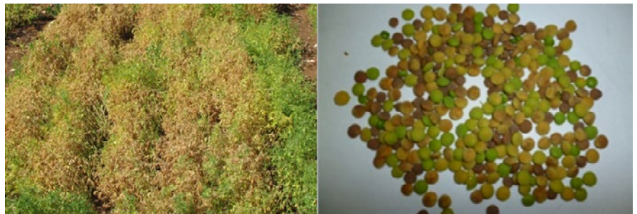
Photo 11: Lentil crop with ryegrass at its optimum stage for crop-topping (2011).