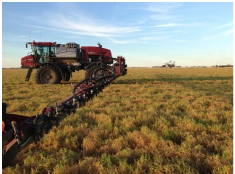
Photo 10: Desiccating lentil. Note the green wheel tracks from previous traffic.