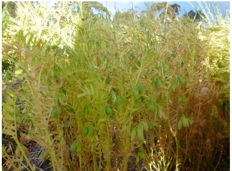
Photo 1: A lentil crop showing different stages of development of pods within the canopy.