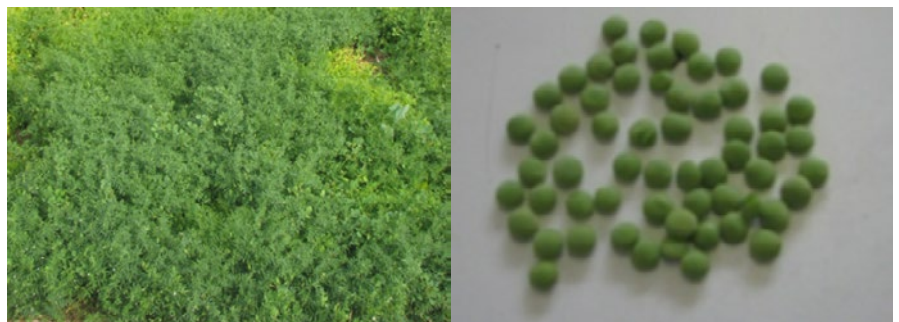
Photo 14: Lentil crop with ryegrass at its optimum stage for crop-topping (2010).

Photo: Grain yield implications of crop-topping pulses for late weed control in south-eastern Australia. "Capturing Opportunities and Overcoming Obstacles in Australian Agronomy", (2012), Proceedings of 16th Australian Agronomy Conference 2012, http://www.regional.org.au/au/asa/2012/weeds/8099_linesml.htm