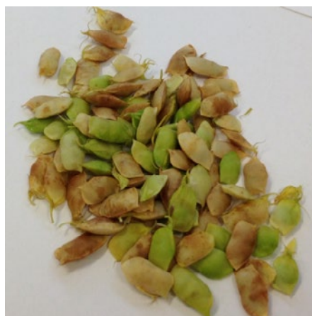
Photo 16: Varying stages of maturity of pods of PBA Hurricane XT th at the stage of crop-topping.