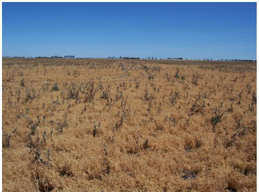
Photo 2: A lentil crop that has been desiccated for easier harvest due to the presence of broadleaf weeds.