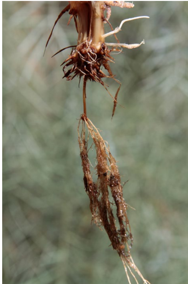
Figure 5: Rhizoctonia can cause reddish-brown sunken lesions on the below ground portion of the stem of crops – as illustrated in this wheat plant.