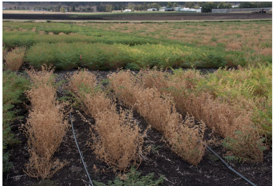
Figure 4: Phytophthora root rot can cause significant lupin losses in susceptible areas in some seasons, with damage in control plots of chickpea with no chemical protection shown here at a NSW trial site in 2017.