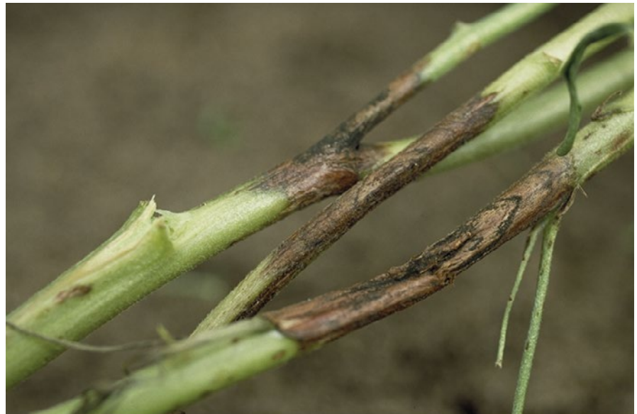
Figure 1: Pleiochaeta root rot infection on lupin stems.