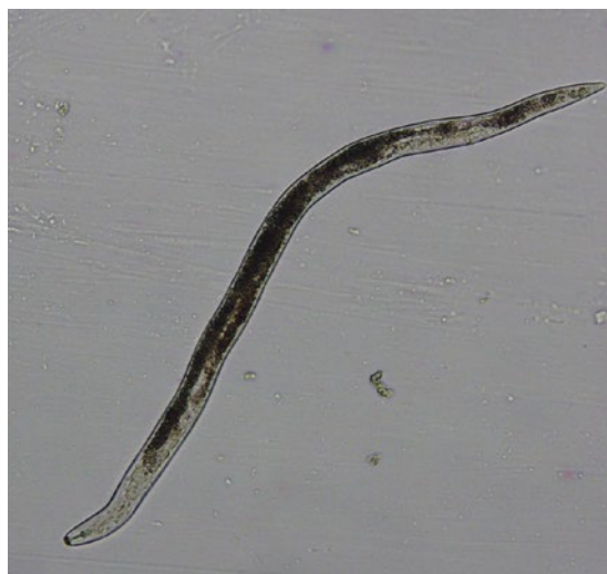
Figure 6: Root lesion nematodes are worm-like microscopic endoparasites that feed on plant roots and can cause patches in crops.