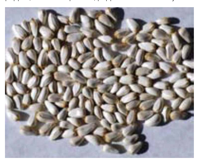
Figure 1: Safflower seed.