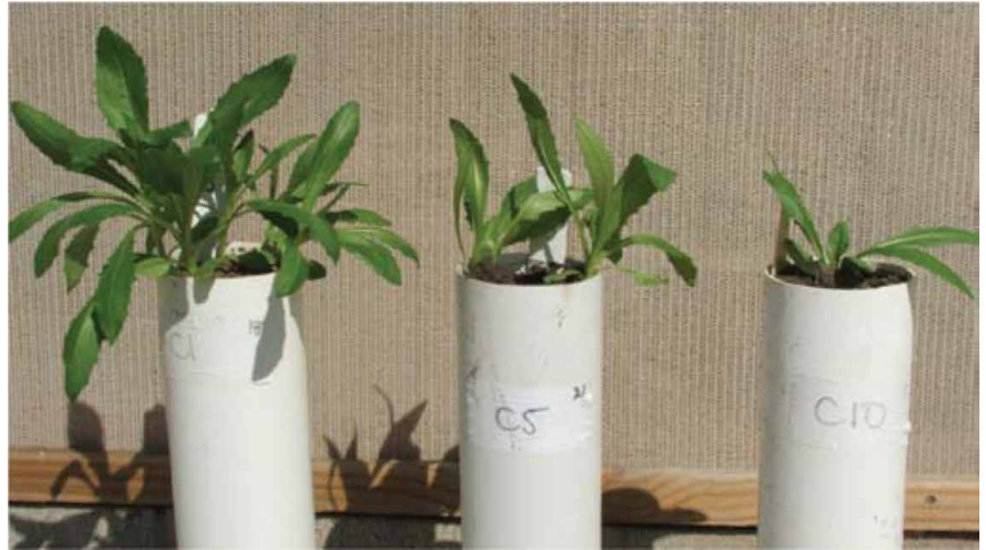
Figure 5: Seven-week-old safflower plants sown at depths of 1, 5 and 10 cm in clay soil.