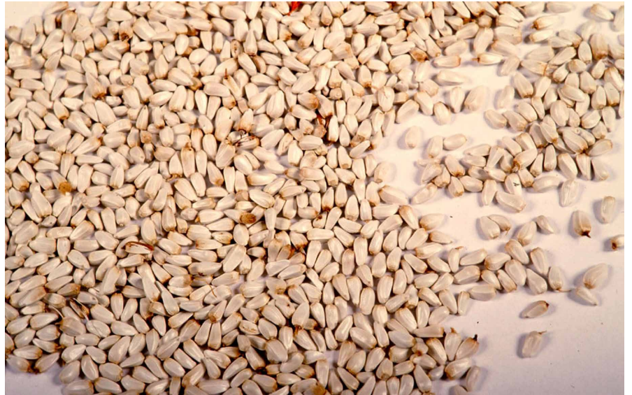
Figure 1: Safflower seed.

The fungicide thiram is commonly applied to safflower seed (Figure 1) to provide protection against seed-borne fungi that cause seed rot and seedling damping off. However, infections contained within the seed, such as Alternaria carthami , may still occur, even with a fungicidal dressing.