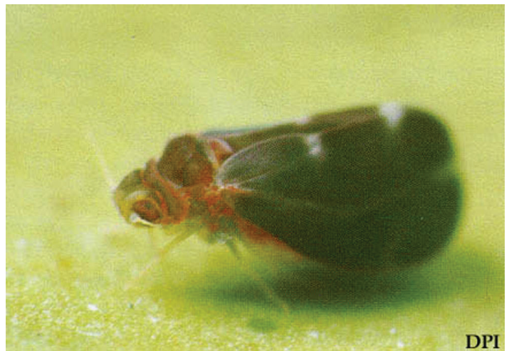
Figure 3. Adult citrus blackfly, Aleurocanthus woglumi Ashby.

The identification key provided here is designed to identify the four major species of whiteflies that commonly infest citrus in Florida. Another key that covers 16 species of