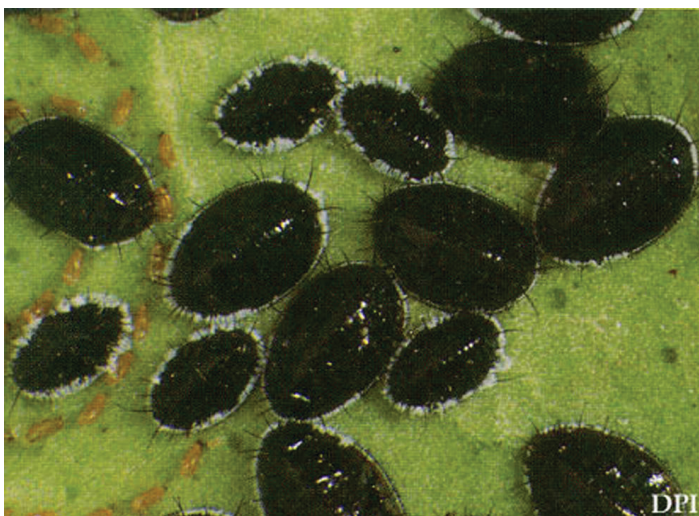
Figure 2. Pupa of citrus blackfly, Aleurocanthus woglumi Ashby.

The fourth instar, or so-called pupa case, is ovate and a shiny black with a marginal fringe of white wax (Figure 2). The sex is readily distinguishable. Females average 1.24 mm long by 0.71 mm wide; males are 0.99 mm long by 0.61 mm wide. The pupal stage lasts 16 to 50 days (Dietz and Zetek 1920, Dowell et al. 1981).