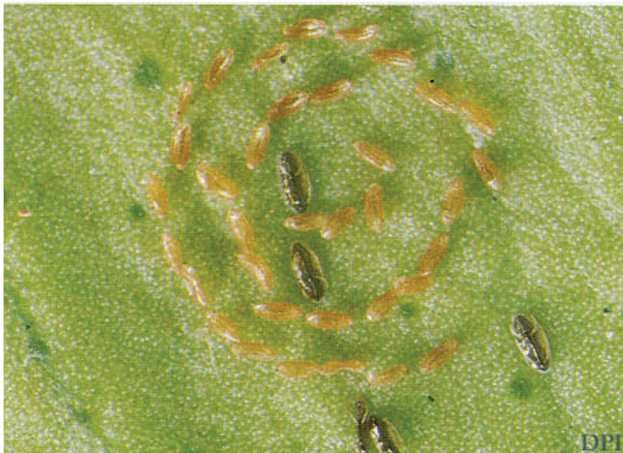
Figure 1. Citrus blackfly, Aleurocanthus woglumi Ashby, egg spiral and first instars.

While the citrus blackfly, Aleurocanthus woglumi Ashby (Figure 1), is a serious citrus pest of Asian origin (Dietz and Zetek 1920), it is usually under effective biological control in Florida. Although a member of the whitefly family, the adult of this species has a dark, slate blue appearance that led to it being given the name “blackfly.”