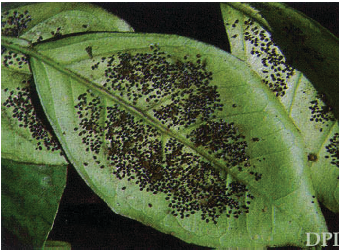
Figure 4. Heavy infestation of citrus blackfly, Aleurocanthus woglumi Ashby, on citrus leaves.