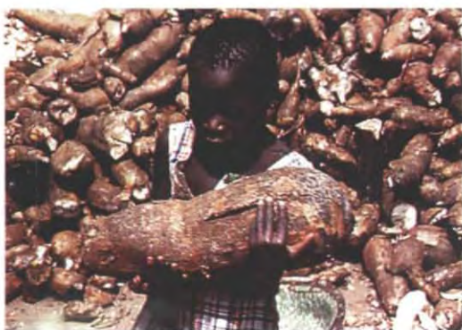
Figure 23: Good cassava storage root yield