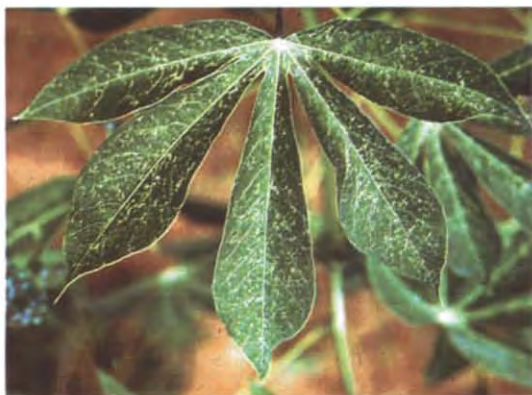
Figure 5: Cassava leaf with chlorotic (pale) spots caused by cassava green mite