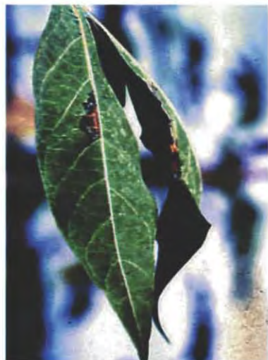
Figure 7: Cassava leaf with angular leaf spots of cassava bacterial blight