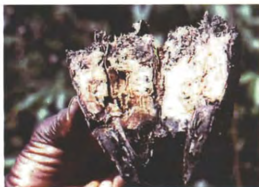
Figure 21: Cassava storage root destroyed by root rot disease