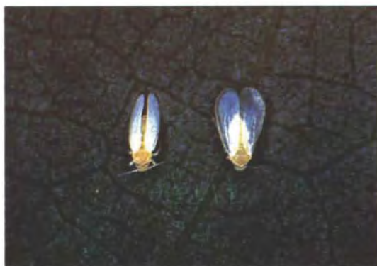
Figure 6: Adults of Bemisia whitefly (as seen enlarged under the microscope)