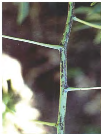
Figure 19: Cassava stem with "streaks" of cassava brown streak disease