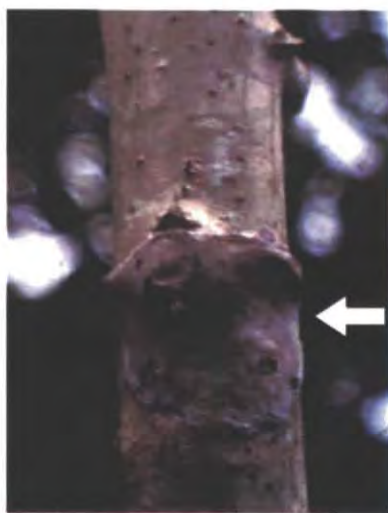
Figure 14: Cassava stem with fungal patch (arrow) of bud necrosis disease