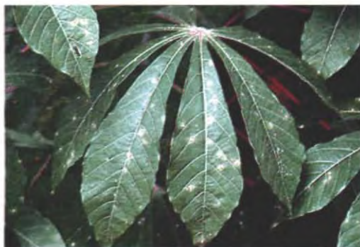
Figure 15: Cassava leaf with white leaf spot disease