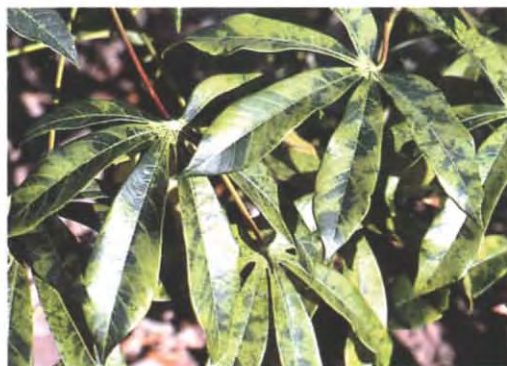
Figure 18: Cassava leaves with chlorotic (pale) patches of cassava brown streak disease