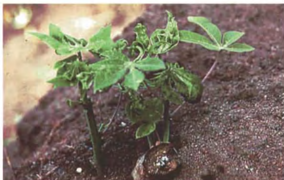
Figure 26: Cassava stem cutting sprouted with cassava mosaic disease