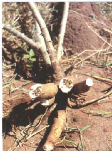
Figure 20: Cassava storage roots discolored by cassava brown streak disease