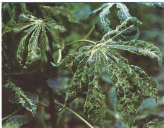
Figure 4: Cassava leaves with chlorotic (pale) patches of cassava mosaic disease