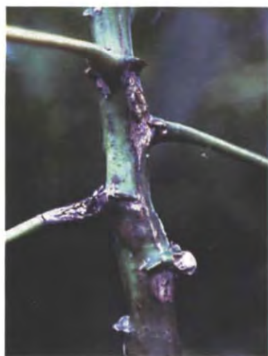
Figure 11: Cankers of cassava anthracnose disease at the bases of cassava leaf petioles