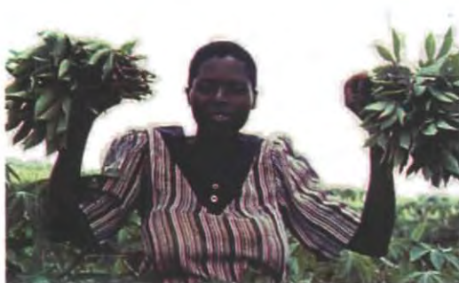
Figure 24: Good cassava leaf harvest