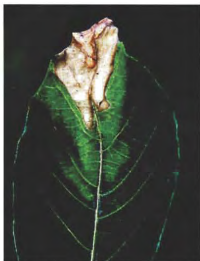
Figure 8: Cassava leaf blighting caused by cassava bacterial blight