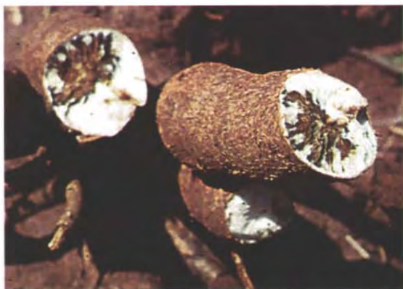
Figure 3: Cassava storage roots damaged by cassava brown streak disease