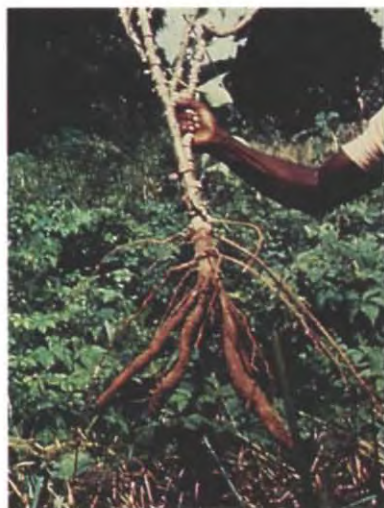
Figure 22: Poor cassava storage root yield