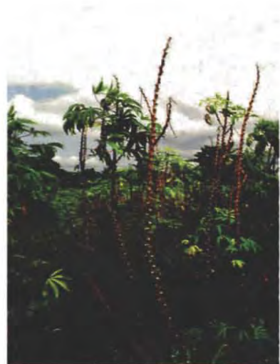
Figure 10: Cassava shoot tip die-back caused by cassava bacterial blight