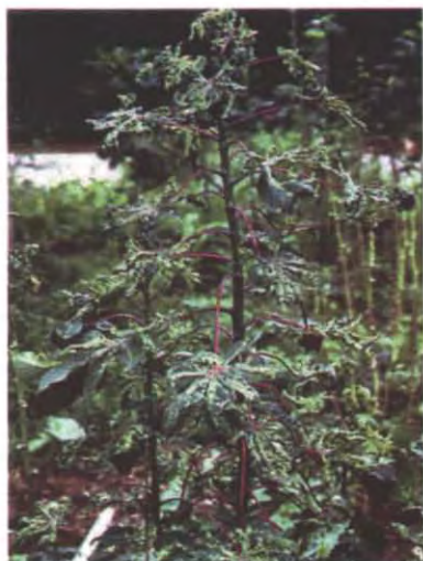
Figure 1: Cassava plant damaged by cassava mosaic disease