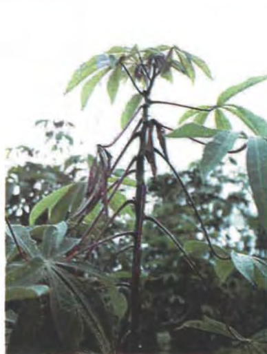
Figure 12: Cassava shoot with wilted leaves caused by cassava anthracnose disease