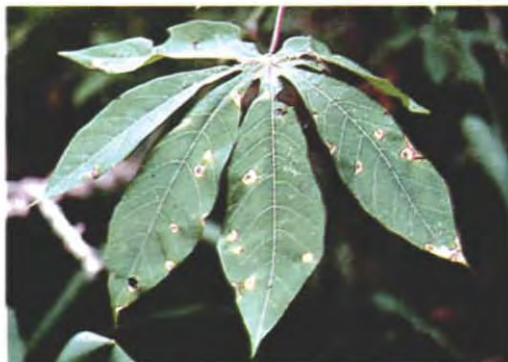
Figure 16: Cassava leaf with brown leaf spot disease