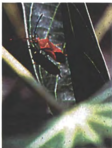
Figure 13: The bug Pseudotheraptus devastans on cassava leaf