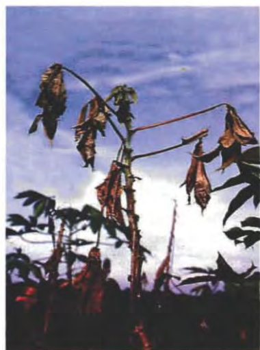
Figure 9: Leaf blighting and wilting caused by cassava bacterial blight