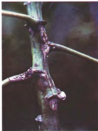
Figure 2: Cankers of cassava anthracnose disease on stem