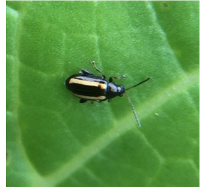
Photo 1. Distinctive stripes of the Chinese cabbage flea beetle, Phyllotreta undulata .

Look for the pinprick-size scrapings and holes in the leaves. Look for tiny beetles (2 mm long) with two broad yellow stripes on their backs. They can be found within the whorl of new leaves and on the back of older ones.