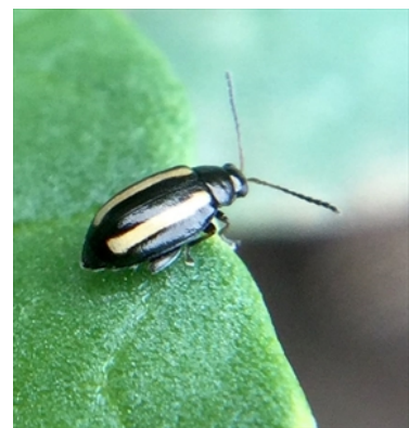
Photo 2. Distinctive stripes of the Chinese cabbage flea beetle, Phyllotreta undulata .