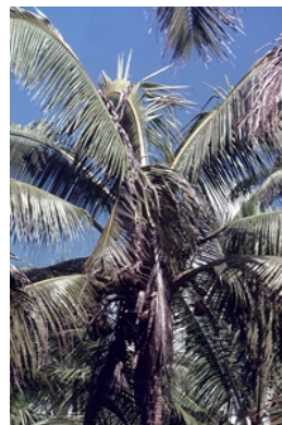
Photo 1. Bud rot of coconut showing the collapse of the spear and younger leaves due to infection by Phytophthora palmivora , while the older leaves appear relatively healthy at this time.

Look for a wilt of the spear leaf, which bends over slightly. Look at the bases of the petioles of the young leaves to see large yellow to brown rots. At this stage, the rot has probably completely destroyed the bud. Look to see that the outer leaves remain green for some months after the death of the spear and inner leaves.