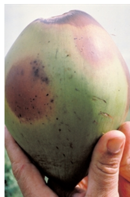
Photo 2. Nuts are also infected by coconut bud rot causing premature nutfall. In this case, Phytophthora hevae was isolated from the rot.