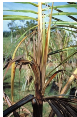
Photo 4. Basal stem rot of coconut seedling, caused by Phytophthora palmivora .