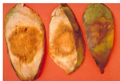
Photo 3. Slices from nuts (Photo 2) showing internal infections by Phytophthora hevae .