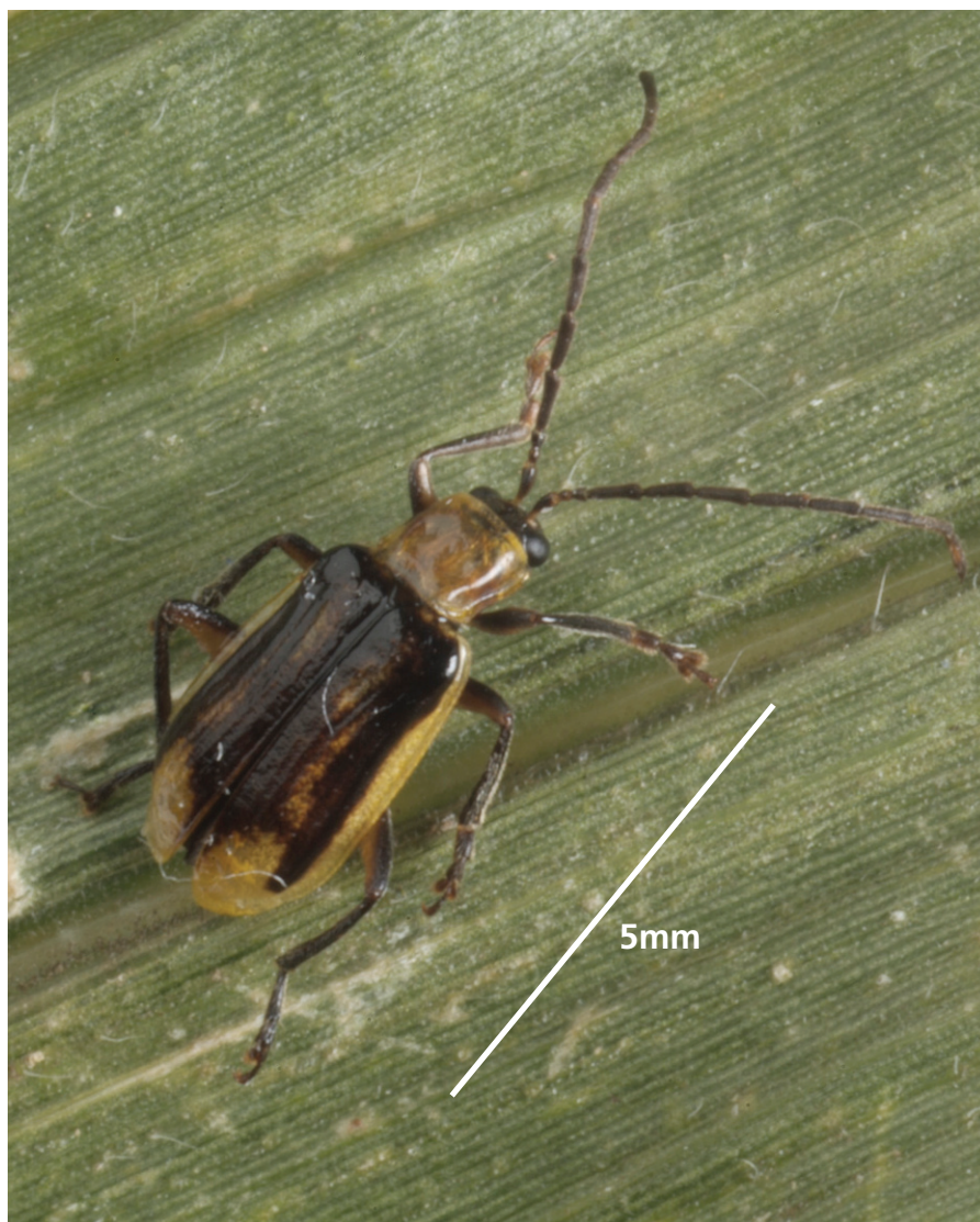
Adult of the Western corn rootworm

It was first reported in the UK in 2003 on maize near London Heathrow and Gatwick airports. Statutory action is continuing in the affected areas.