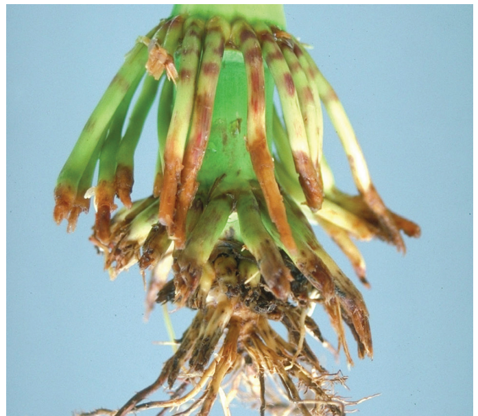
Damage to maize roots by larvae