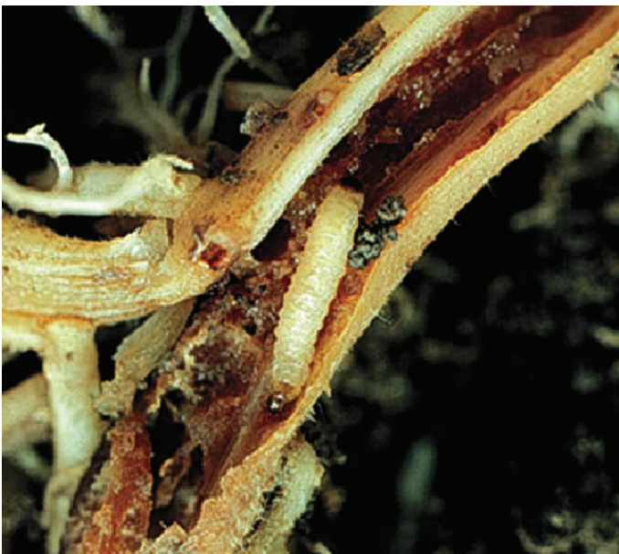
Larva feeding in maize root

Both adults and larvae feed on the plant, but larval root feeding is the main cause of damage, reducing nutrient uptake and growth. Root damage weakens plants and makes them more susceptible to lodging in wet or windy conditions. This can affect or even prevent crop harvesting. Adults feed on flowering maize pollen, silks, leaves and young developing kernels, but can also feed on a wide range of other plants that flower in the summer and offer alternative sources of pollen. However, larvae very rarely complete their life-cycle successfully on other plant species.