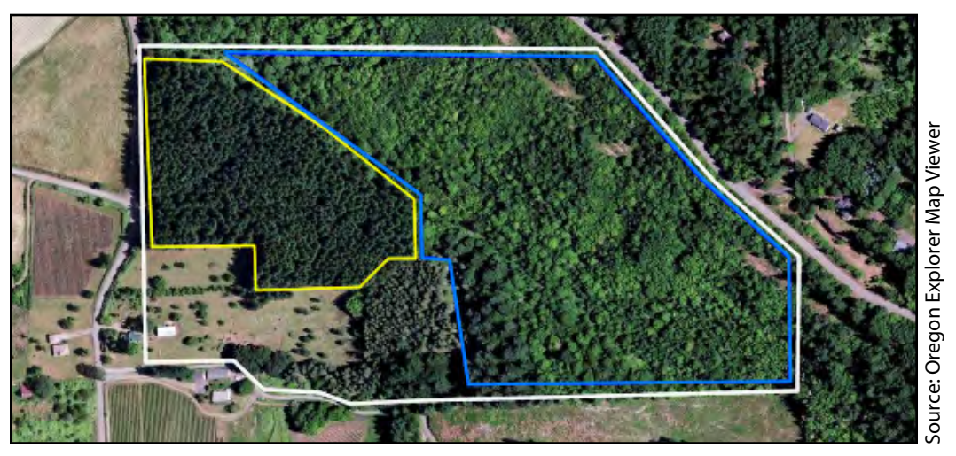
Figure 3. An aerial map of a property that delineates two management units. The unit outlined in yellow is an even-aged conifer stand. The unit outlined in blue is a patchy, mixed conifer/hardwood stand with trees of varying sizes.

and MyLandPlan are a few useful mapping sites. Table 1 provides links to these sites and details on their capabilities. If you do not have easy computer access, the local office of one or more of these government agencies can help you obtain the maps and photos you need: