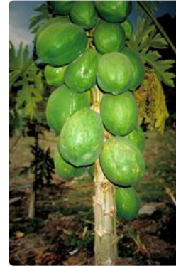
Photo 3. Ringspots on papaya fruits, caused by Papaya ringspot virus - type P.