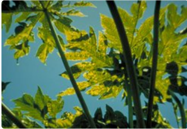
Photo 1. Leaf symptoms on leaves of papaya affected with Papaya ringspot virus - type P. Note the leaves with light yellow and green patches (mosaics), and the deformed leaf on the left.