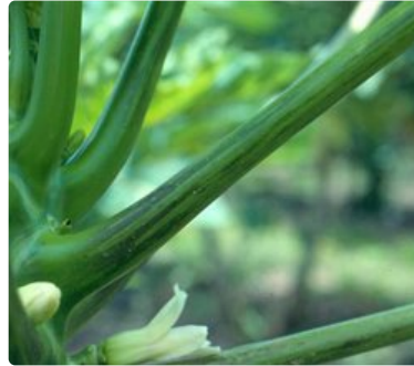
Photo 2. Dark green stripes on leaf stalks of papaya, caused by Papaya ringspot virus - type P.