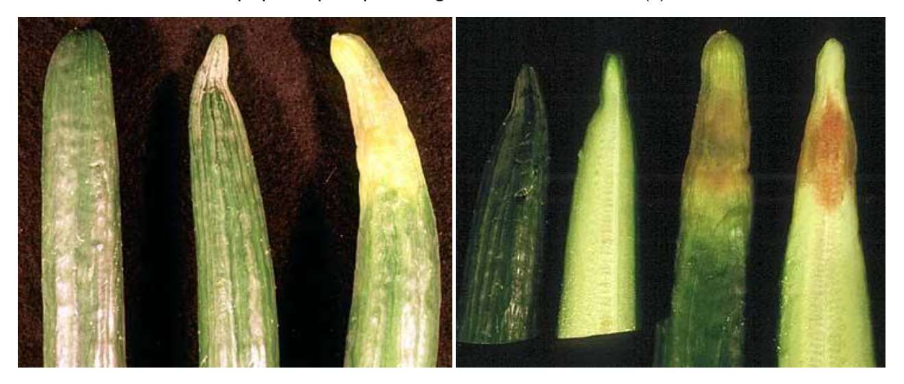
Figure 2. Healthy cucumber fruit on left and two infected cucumber fruits on right with tapering end indicating internal fruit rot (A), and two cucumber fruits on left with early symptoms of pre-harvest internal fruit rot, and two cucumber fruits on right with severe symptoms of post-harvest rot (B).