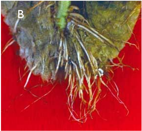
Figure 1. Pythium crown and root rot in greenhouse cucumber showing orange discolouration of the crown area (A) and rotted roots and root tips (B).