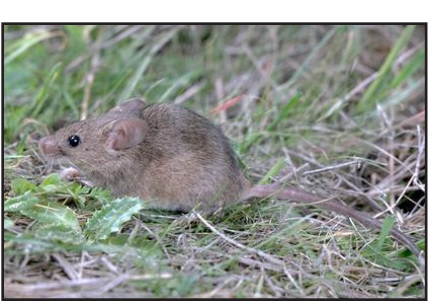
Figure 1. House mouse.