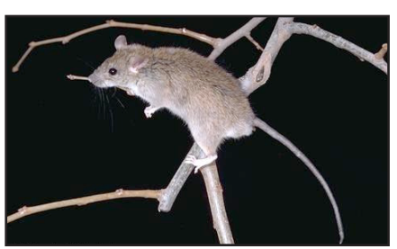
Figure 4. Roof rat.