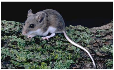
Figure 2. The deer mouse is sometimes found in homes and outbuildings and is a reservoir of the deadly Sin Nombre hantavirus.