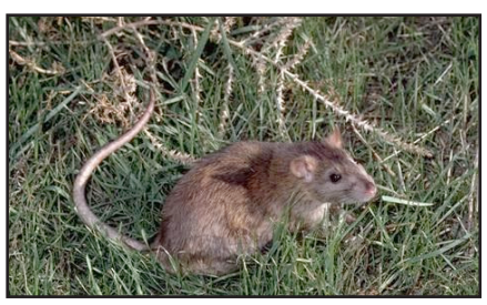
Figure 3. Adult rats, such as this Norway rat and the roof rat below, are much larger than mice.