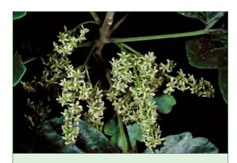
Figure 4. Poison oak flowers.