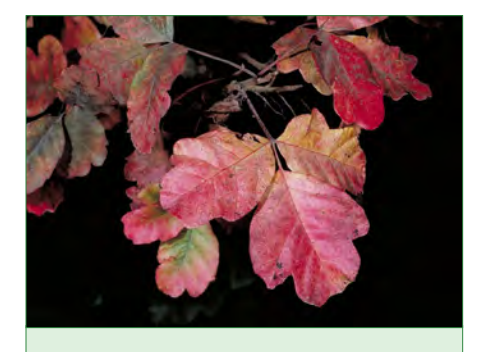
Figure 6. Poison oak fall foliage.