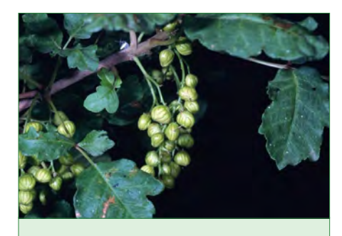
Figure 5. Poison oak fruit.