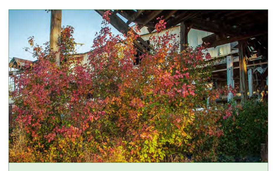
Figure 1. Poison oak shrub in late summer, showing green foliage on the right and autumn colors (seasonal decline) on the left.