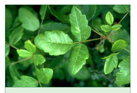
Figure 3. Poison oak showing 3 leaflets with the central leaflet having a longer stalk than the other 2.

In California, the number of working hours lost as a result of dermatitis from poison oak makes it the most hazardous plant in the state. Approximately 50% to 75% of the adult population is sensitive to urushiol. In large urban areas, where these plants are less common, the prevalence is closer to 20%. Peak sensitization occurs between 8 and 14 years of age with infants not as easily sensitized as adults. Once a reaction occurs, repeated exposures further increase sensitivity. Conversely, long periods with no