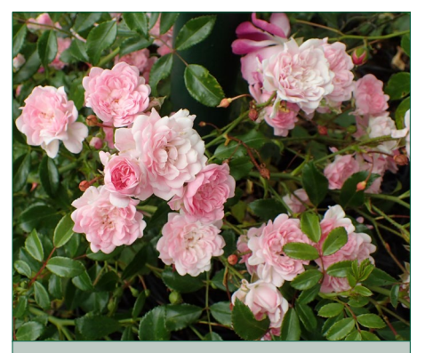
Figure 4. The polyantha rose variety 'The Fairy.'