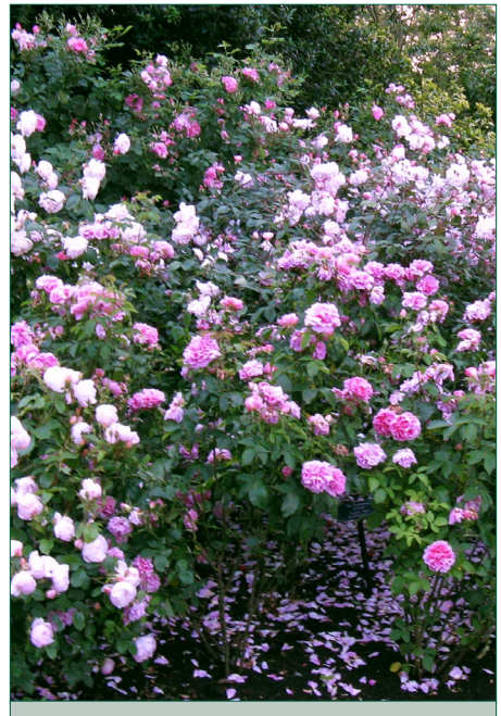
Figure 2. Hybrid teas and grandifloras.