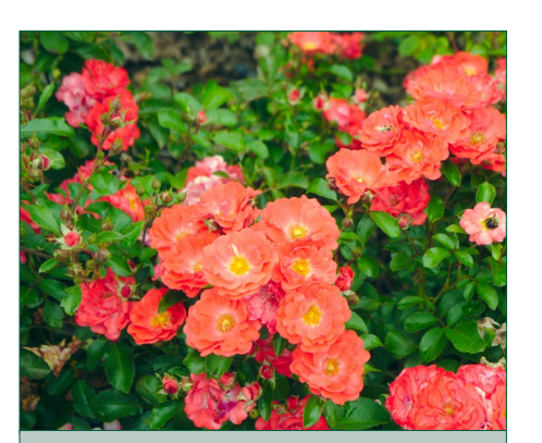
Figure 6. Mounding landscape shrub roses, such as 'Coral Drift,' are more rambling than upright varieties.

Frequency and duration of irrigation will depend on weather conditions and soil texture. Roses do best when 50% of available water is depleted between irrigations. Checking after irrigation to determine soil moisture status and rate of depletion is helpful in scheduling irrigation.