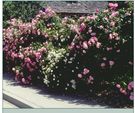
Figure 5. Upright landscape rose varieties such as Pink Simplicity, shown here, are medium to large shrubs.

Roses are often purchased in late winter or early spring as bare-root plants. To maintain plant health prior to sale, these plants should be held in the nursery under cool conditions with their roots kept moist. Packaged plants should also be kept cool because warm temperatures hasten loss of carbohydrate reserves and contribute to gradual desiccation of wood, resulting in difficulty in establishment. After purchase, these plants should be kept shaded and moist and planted into the garden as soon as possible. Plant roses at about the same height they were growing in the production field or container, with the graft union (if present) above the soil surface. Compost should not be added to soil in most situations, since compost can affect water movement and impede drainage.