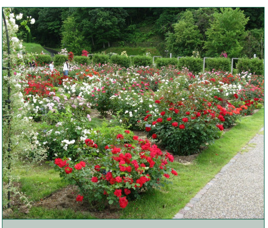
Figure 1. Roses in a traditional garden setting.

Hybridizing with floribunda varieties has resulted in the relatively recent development of landscape roses, also called shrub roses, which are cultivars selected specifically for use