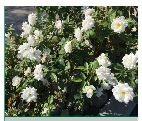
Figure 3. The rose variety 'Iceberg,' a cluster-flowered floribunda.

Landscape roses are available in three approximate growth forms: upright plants, mounding shrub roses, and ground covers. Some examples are listed below, but new cultivars are developed and released on an annual basis.