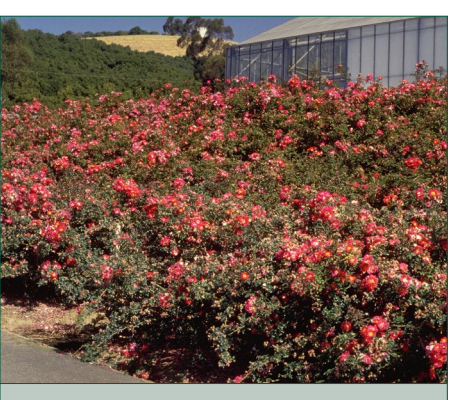
Figure 7. Groundcover roses such as 'Ralph's Creeper,' shown here, are useful for covering banks or walls.

Daily irrigation should not be necessary even in the desert areas of California. For example, in the Central Valley, rose plants in production fields are irrigated, at most, at 8-day intervals