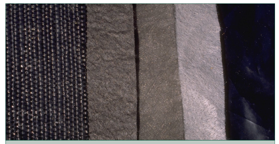
Figure 10. Different types of fabric mulch weed barriers. Woven barriers provide best weed prevention.

In most home gardens, mulches supplemented with regular hand-weeding or rogueing (digging out the entire plant, roots and all) should provide satisfactory weed control. Mechanical cultivation devices such as hoes must be used with care because roses are shallow-rooted. In extensive plantings or professionally managed public or commercial landscapes, mulches and hand-weeding can be supplemented with herbicides. Some of the herbicides