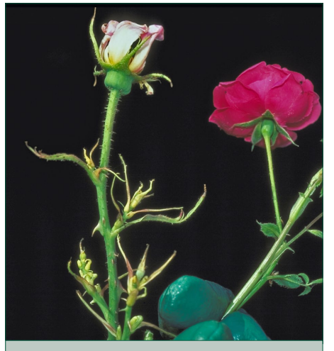
Figure 11. Landscape rose with chlorotic, underdeveloped blossom and puckered needlelike shoots caused by the herbicide glyphosate.

To control established grasses, the postemergence herbicides fluazifop-p-butyl (Fusilade) and clethodim (Envoy) were effective in field trials. When these herbicides are used according to label directions, they will not injure rose plants.