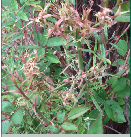
Figure 12. Landscape rose with small, needle-like shoots typical of injury from the herbicide glyphosate.

Roses are sensitive to postemergence broadleaf herbicides that may be used in landscapes, such as 2,4-D, triclopyr, and dicamba; these should not be used in or near planting beds with roses. Generally, use broadleaf herbicides with great care when rose plants are present in nearby landscapes so as not to cause damage from drift.