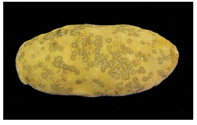
Figure 3. Silver scurf on Russet Burbank following secondary infection in storage.

in storage are circular and produce a random "measles" appearance over the surface of the potato (Figure 3).