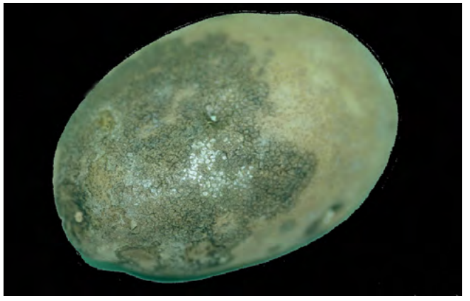
Figure 1. Silver scurf infection originating from the field.

Infection and symptom development begin in the field. Though most economic damage usually occurs