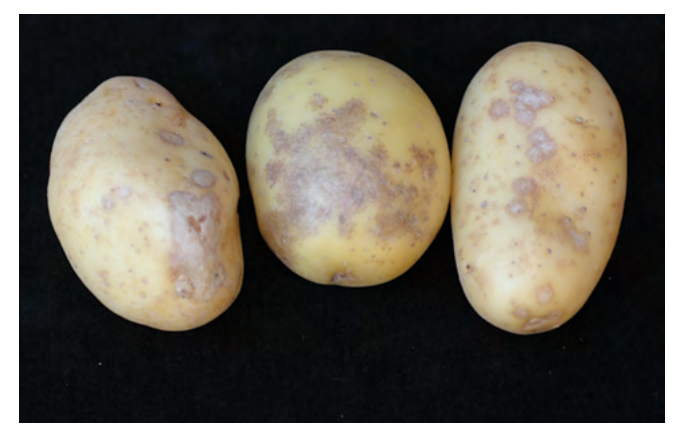
Figure 5. The tuber on the left shows a primary infection by silver scurf, the tuber in the center shows a primary infection by black dot, and the tuber on the right shows secondary infections by silver scurf. Notice the more defined margin associated with silver scurf.

tree"-shaped structures. These are spore-producing conidiophores (Figure 4). The "branches" are spores; if the spores are dislodged, the conidiophores look like short, black strings.