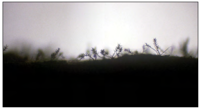
Figure 4. Close-up view of silver scurf on tuber. The "branches" are conidia (spores); if the spores are dislodged, the conidiophores look like short, black strings.

After tubers have been stored at high humidity, the margins of young lesions may appear sooty due to the presence of fungal spores. Close evaluation with a hand lens or microscope may reveal "Christmas