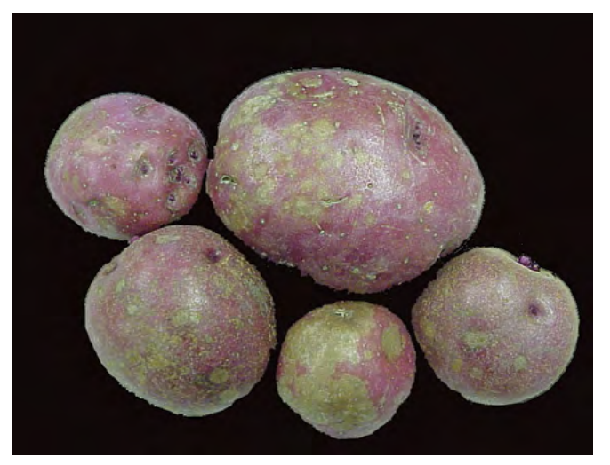
Figure 2. Silver scurf on red potatoes.

after tubers have been stored for 3 months or more, damage to smooth-skin cultivars can be severe enough at harvest to render tubers unmarketable.