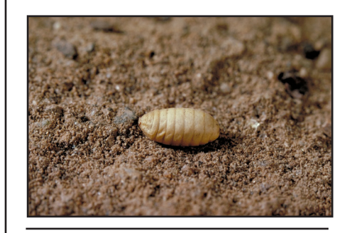
Figure 7. Walnut husk fly pupa on a soil surface.