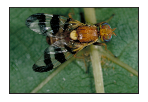
Figure 1. Banded wings of the adult walnut husk fly.

Certain general sanitation practices that reduce the number of husk flies