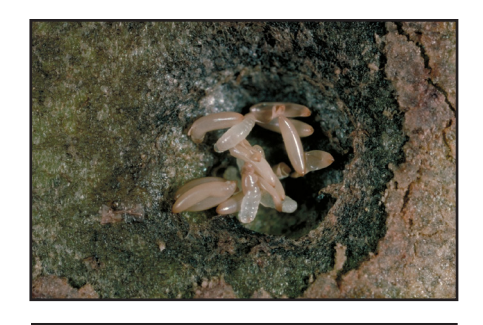
Figure 5. Walnut husk fly eggs beneath the skin of a walnut husk.

registered substance such as molasses for the purpose of controlling home or garden pests on residential property that they own, lease, or rent provided no food or feed commodities treated with the substance are sold, distributed, or fed to animals sold or distributed for human consumption.