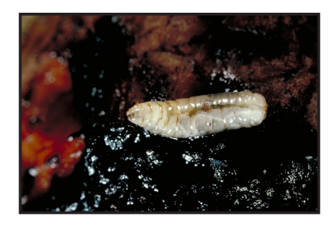
Figure 2. Walnut husk fly larva feeding beneath the skin of a walnut husk.