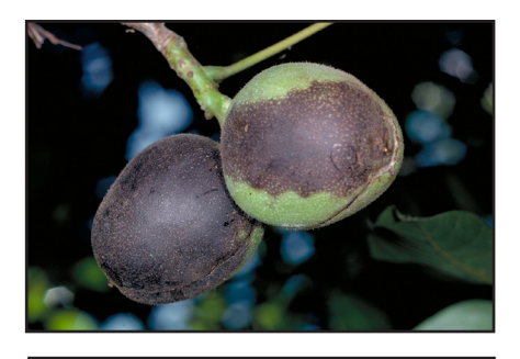
Figure 3. Husks of walnuts infested with walnut husk fly larvae turn black.